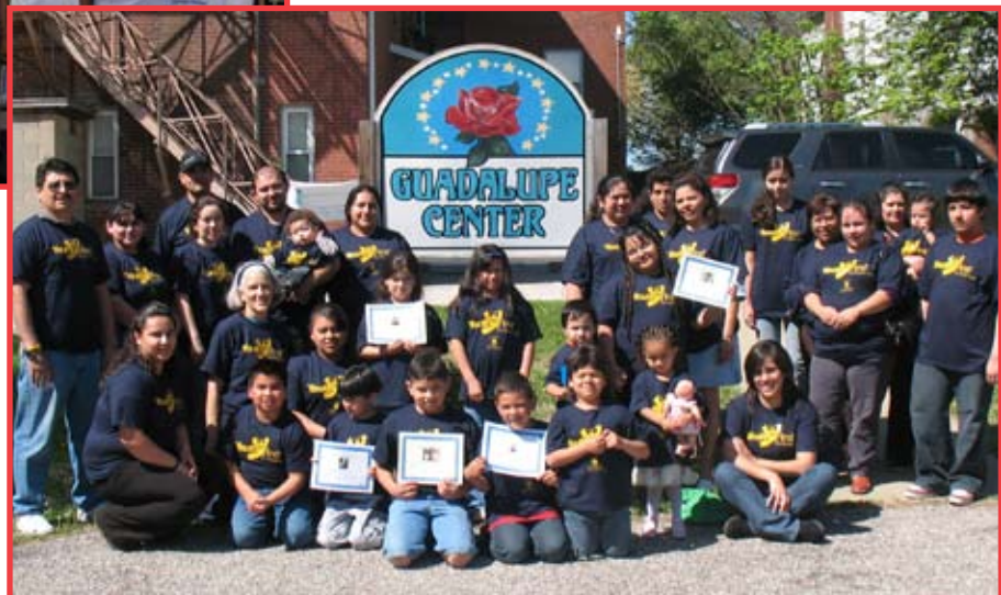
Guadalupe Center in Huntingburg