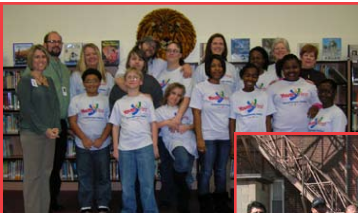
Lincoln Elementary School in Evansville