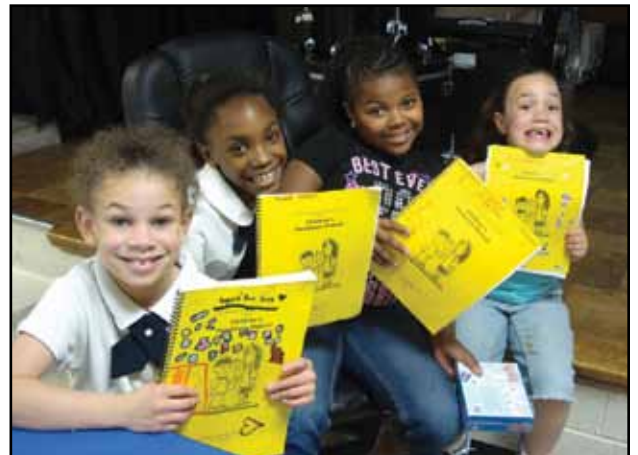
Joshua Academy students enjoy Youth First's Strengthening Families program!